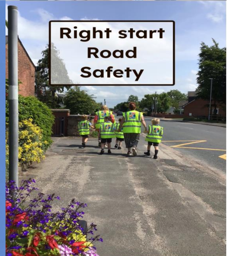
Mere Brow walking day