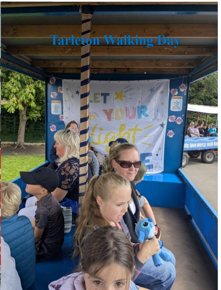
Tarleton Walking Day