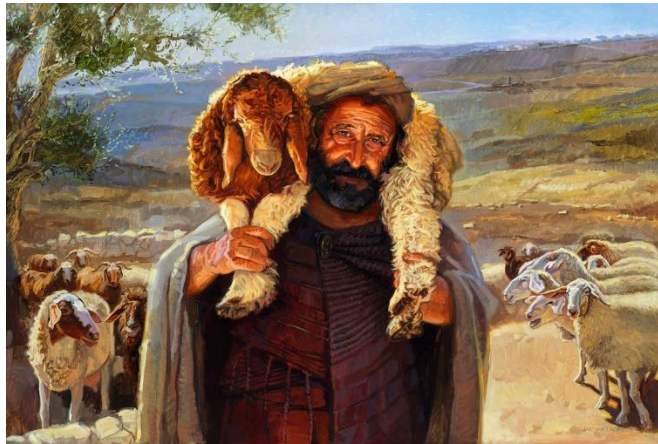
Parable of the Lost Sheep - Luke 15: 3-7