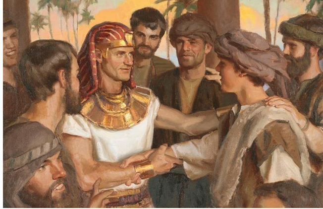
Joseph forgives his brothers - Genesis 50:15-21