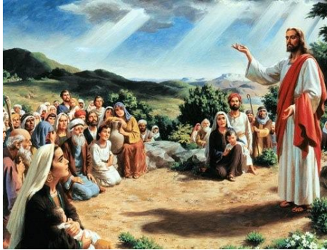
The Lord's Prayer